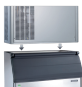
SB 393 SB 530